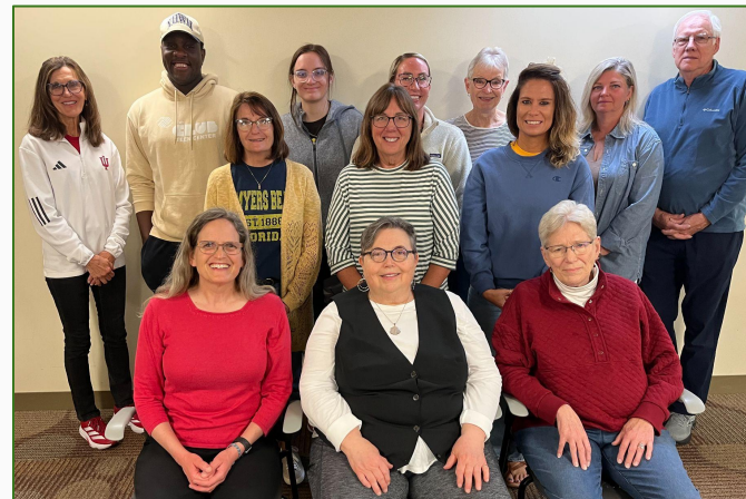
April 2026 SAM Training Participants and Trainers

See www.workitout.org/focus-upcoming-events/ to find more details. If interested, please register by Oct. 2, and help us spread the word.